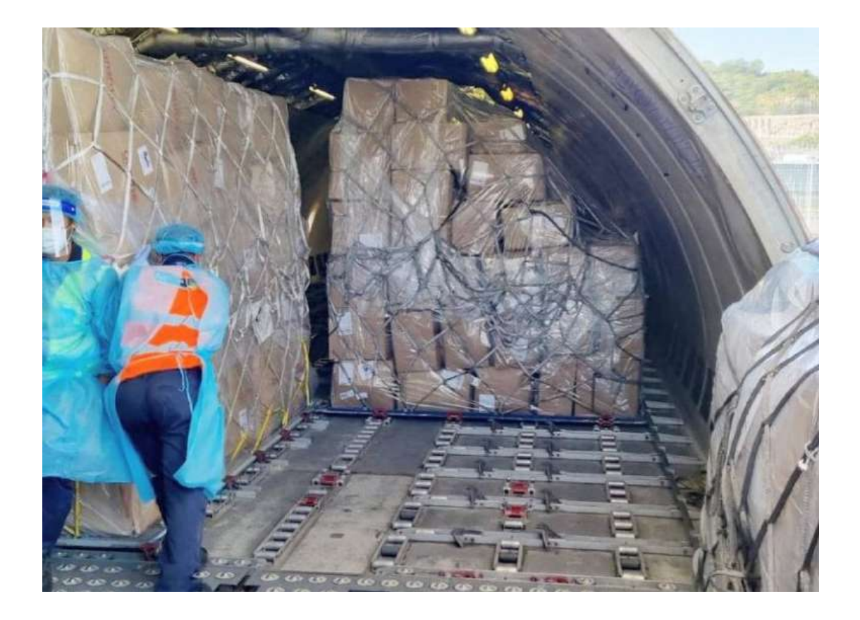
Efficiency Faster transport and reduced transit times